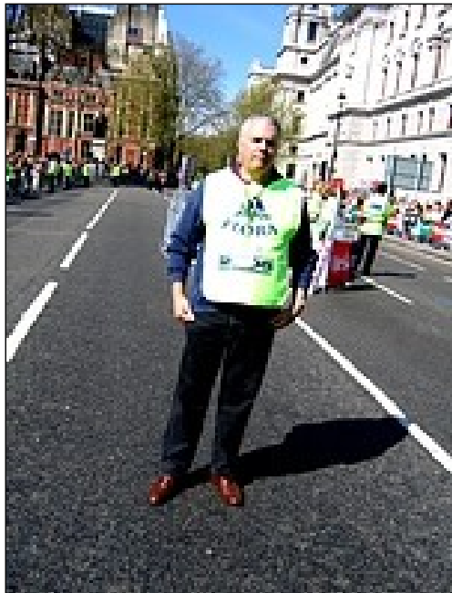
Our other marathon man